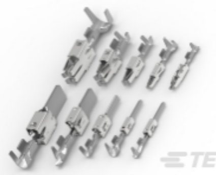
TE Part #CAT-T4827-T273 TIMER, RECEPTACLE AND TAB