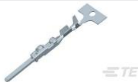
TE Part #1718348-3 MCON 1.2 CB TAB STC AG