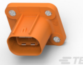
TE Part #1-2103124-1 HEADER ASSY, Ag SHIELD, KEY A, HVA280-2P