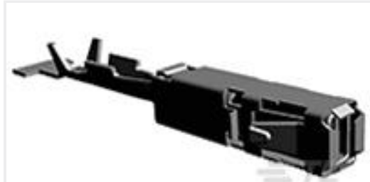
TE Part #1564980-1 AMP MCP 1.5K, CONTACT