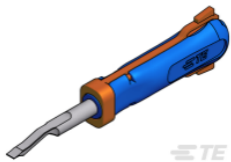
TE Part #2-1579018-5 EXTRACTION TOOL