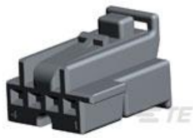
TE Part #1-929170-4 4POS MQS REC COD A