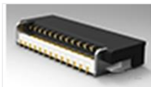
TE Part #1-2040832-8 EMBOSS TAPING 0.25FPC BF-L-1.3