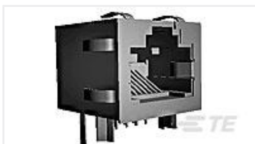
TE Part #2-406541-3 MJ,INV,1X1,6PNL G.,100"ST,SN, NARROW POST