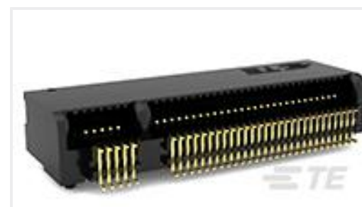
TE Part #1-2199230-6 M.2 0.5PITCH 4.2H KEY M 30U AU