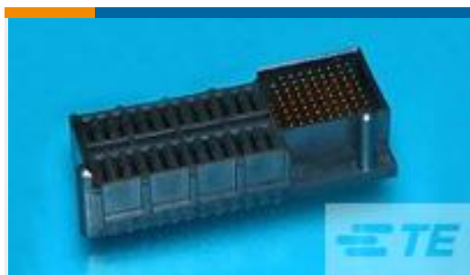
TE Part #1469920-2 Mini Pak HD Micro TCA Power Conn