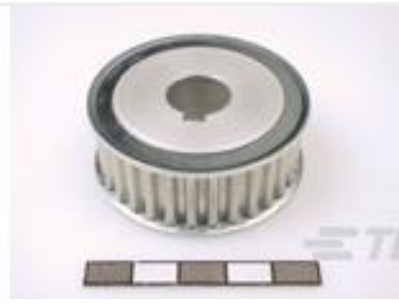
TE Part #9-509910-2 GEAR WHEEL Z32