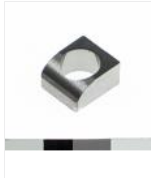
TE Part #8-547609-5 INTERMEDIATE RING