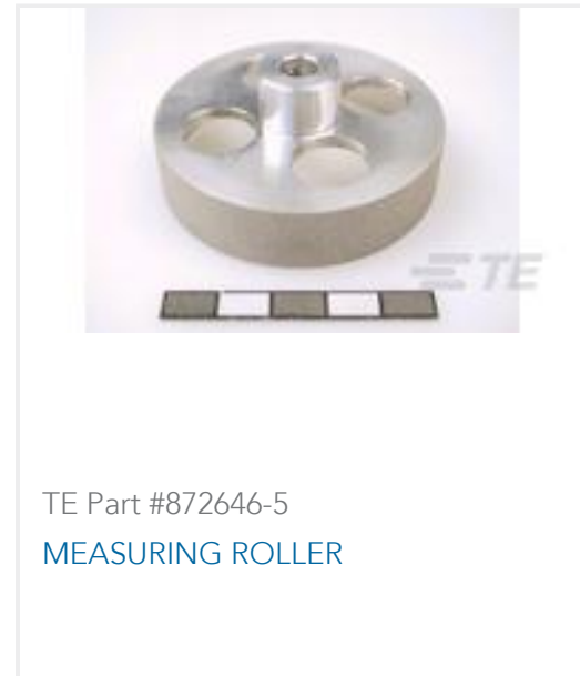
TE Part #872646-5 MEASURING ROLLER