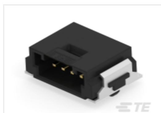
TE Part #474110-E SRCA 1,27 4 M 1-KS SMD 137 E1 094 * GURT