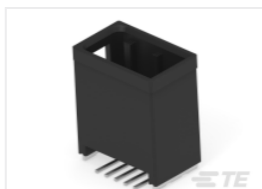
TE Part #2317525-1 2X5POS,NANOMQS,HDR ASSY, 180DEG,SMD,COD A