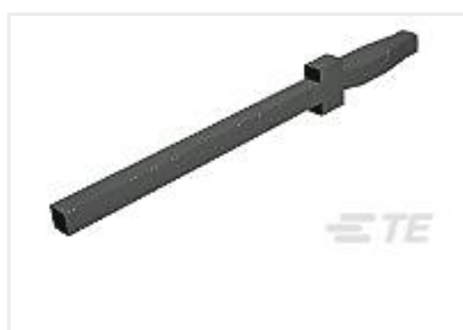
TE Part #2-963964-4 MQS STIFTE MAGAZ