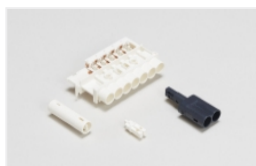
Plug & Socket Lighting Connectors(20)