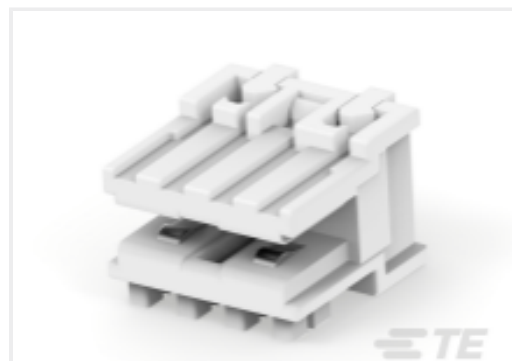
TE Part #2311509-3 DUOPLUG STD, 2 POS, FEMALE CONN