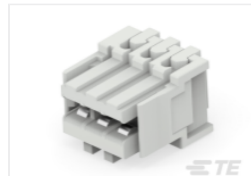
TE Part #2-2402731-3 Same as 2-284865-3 w/ alternative resin CONN