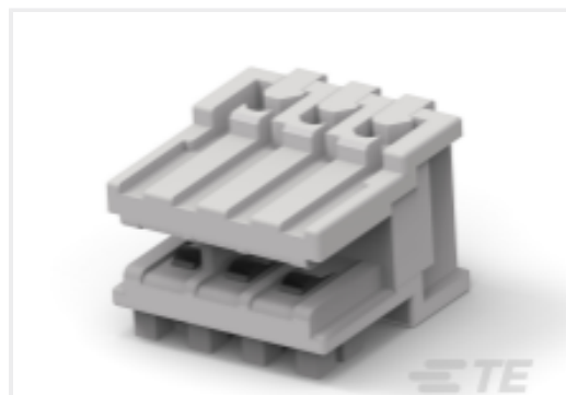
TE Part #4-2311500-3 DUOPLUG STANDARD, FEMALE CONN.