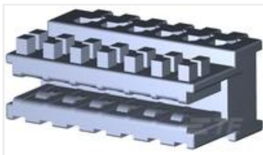
TE Part #284930-6 DUOPLUG Standard, female conn.