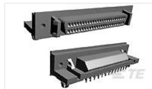
TE Part #5787082-9 100 50SR R/A RCP ASSY,RDSN L/F