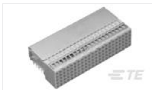
TE Part #5100145-1 Z-PACK/B25 RAF 125P