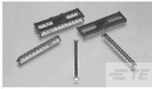
TE Part #3-6318490-6 .5FHR04H,220,S,GIG,08/Sn,HT,NSYes