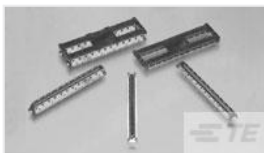
TE Part #3-1827253-6 .5FHP05H,220,S,GIG,08/Sn,HT,NSYes