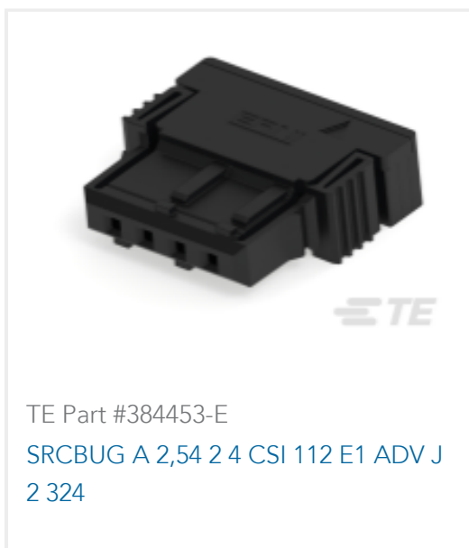
TE Part #384453-E SRCBUG A 2,54 2 4 CSI 112 E1 ADV J 2 324