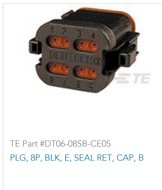
TE Part #DT06-08SB-CE05 PLG, 8P, BLK, E, SEAL RET, CAP, B