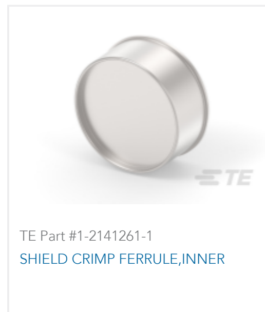
TE Part #1-2141261-1 SHIELD CRIMP FERRULE,INNER