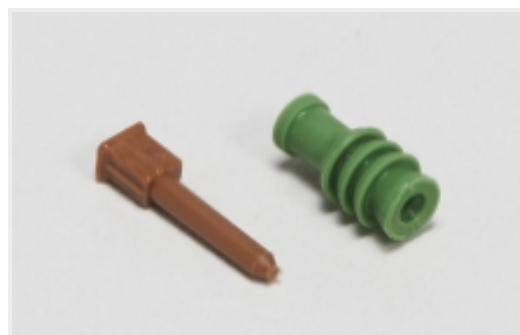
Automotive Seals & Cavity Plugs(6)