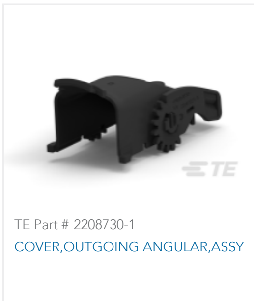
TE Part # 2208730-1 COVER,OUTGOING ANGULAR,ASSY