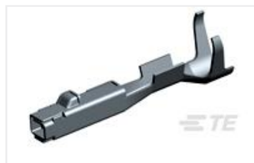
TE Part #1452503-1 MCON 1.2 CB REC SRC SN