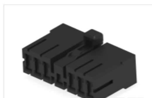
TE Part #172498-1 MIC PLUG HSG 13P (MK II)