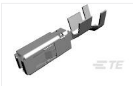
TE Part #1241396-1 AMP MCP 2.8K, CONTACT, SWS