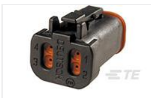
TE Part #DT06-4S-CE05 PLG, 4P, BLK, E, SEAL RET, CAP