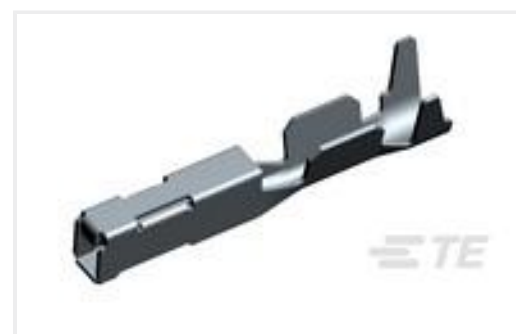
TE Part #2035334-3 CONTACT,FEMALE0.64, 20 TO 22 AWG