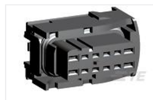
TE Part #284848-1 12 POS MCP HYBRID FEMALE CONN NAT