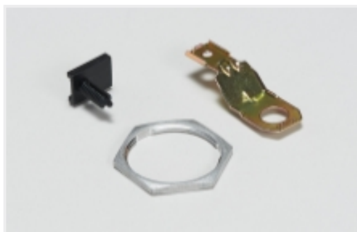
Other Automotive Connector Accessories(1)