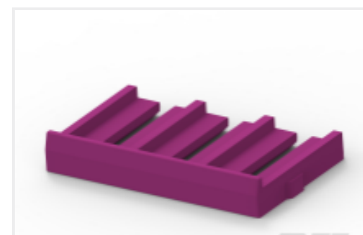
TE Part #2208715-1 2. LOCK,AMP MCP2,8