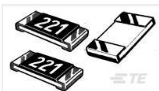
TE Part #1-2176231-4 3522 36R 1% 3W