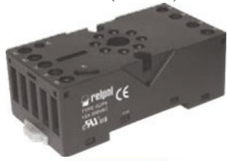
GZP8 (for R2M)