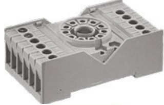
PZ11 (for R2M)