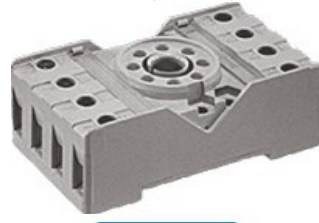
PZ8 (for RY2)