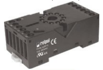
GZP11 (for RUC)